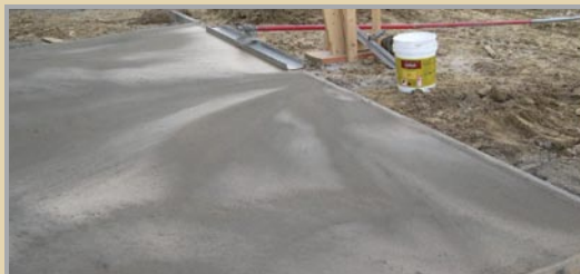
Step 5 - Colour-Hard™ Application