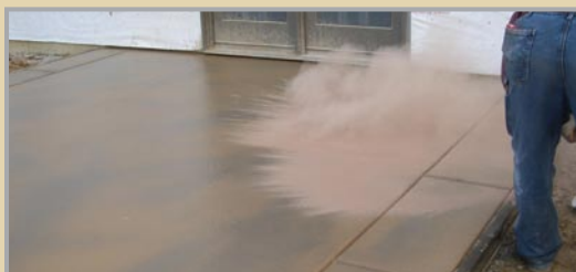
Step 7 - Accent-Colour Release™ Application