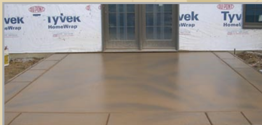
Step 6 - Trowel