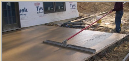
Step 4 - Float