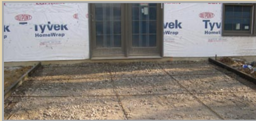
Step 1 - Preparation