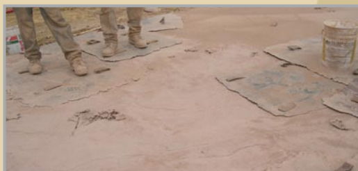
Step 8 - Imprinting