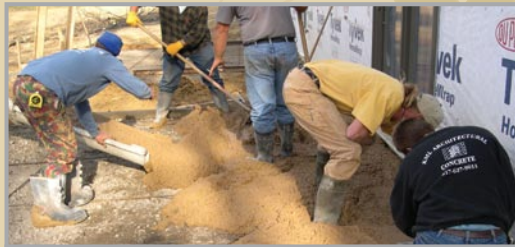
Step 2 - ColorFlo® Concrete Placement