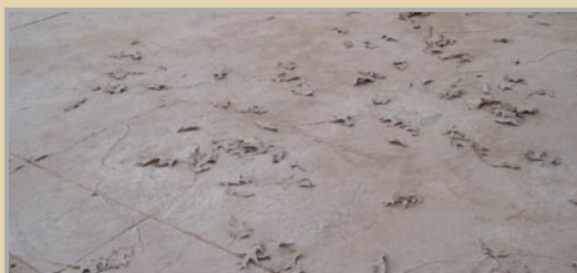
Step 9 - Detail