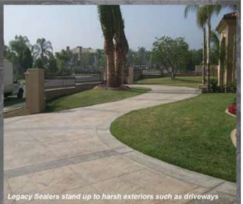
Legacy Sealers stand up to harsh exteriors such as driveways

Legacy ™ DECORATIVE CONCRETE SYSTEMS A DIVISION OF SOLOMON COLORS, INC.