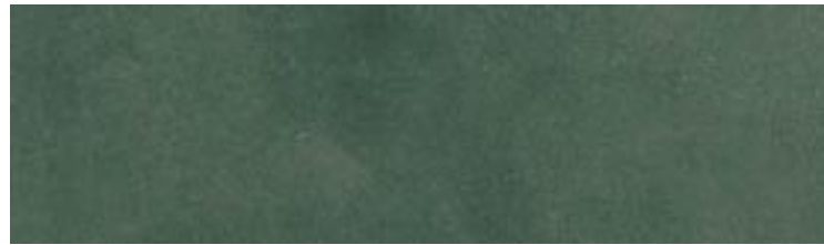
Aged Patina WBS17