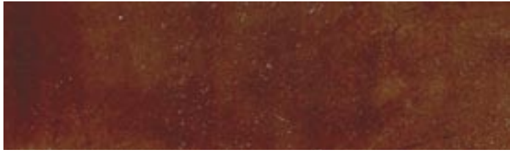
Coral Red WBS31