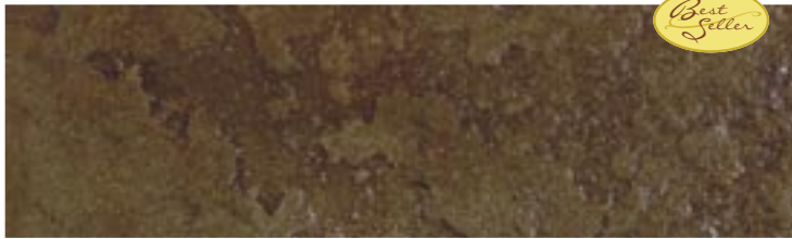
Aged Bronze WBS24