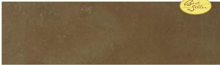
Venetian Clay WBS32